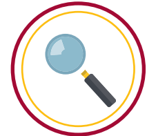
Media Impact Project (MIP)