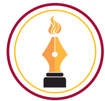
Hollywood, Health & Society (HH&S)