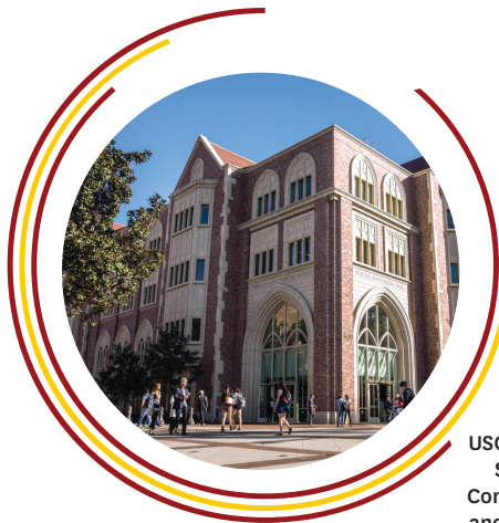
USC Annenberg School for Communication and Journalism