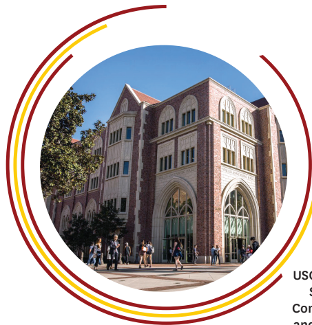
USC Annenberg School for Communication and Journalism