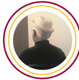
The Norman Lear Center